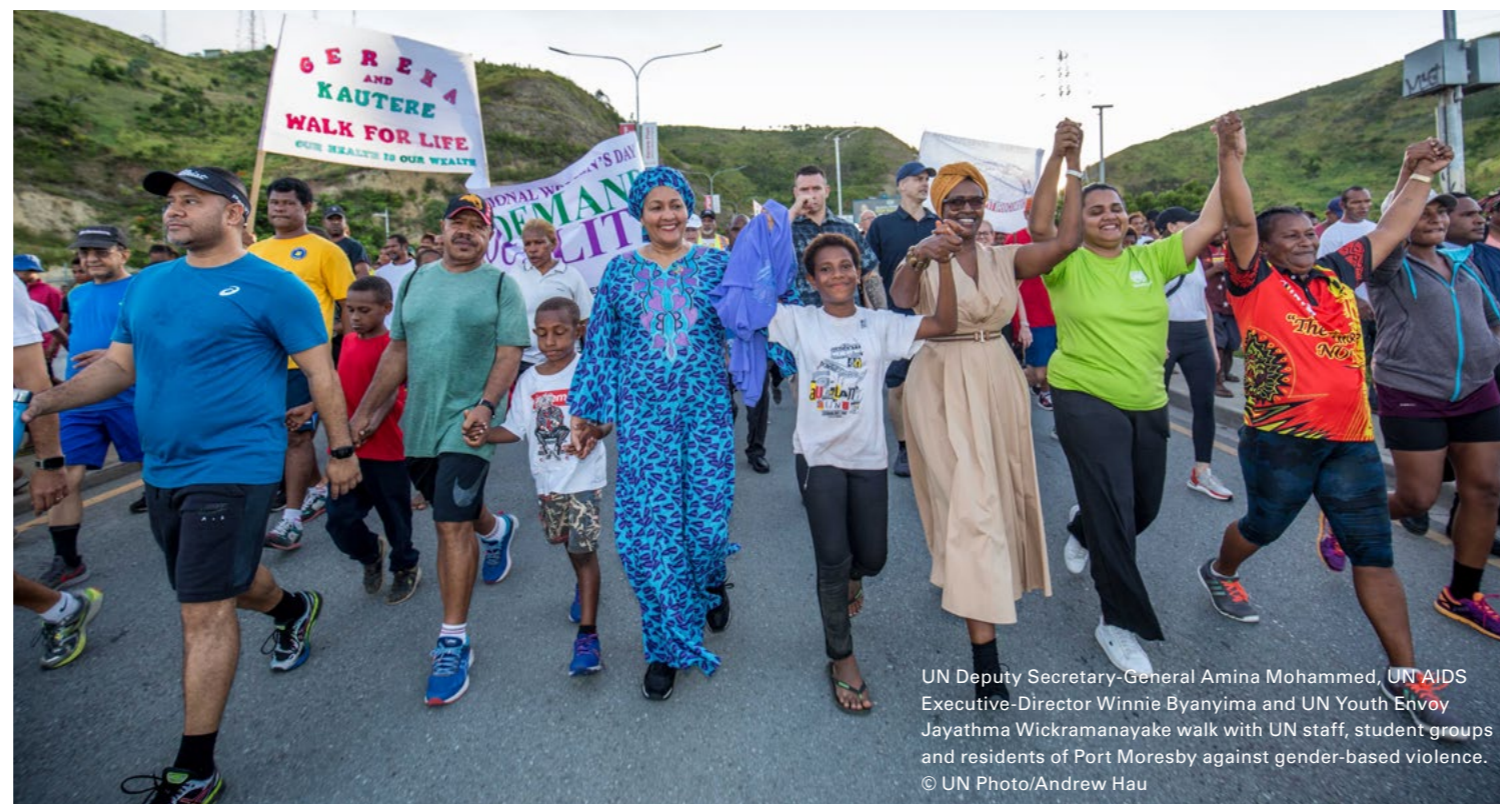
UN Deputy Secretary-General Amina Mohammed, UN AIDS Executive Director Winnie Byanyima and UN Youth Envoy Jayathma Wickramanayake walk with UN staff, student groups and residents of Port Moresby against gender-based violence.

Therefore, although civil society can and should be understood broadly, this understanding must be de-linked from any notion of "stakeholderism": groups' engagement with the UN should be predicated upon their right to be heard simply by virtue of being civil society – and thus their ability to provide accountability, legitimacy and buy-in from a wider public – not upon what they can do for the UN. Service delivery partnerships are frequently mutually beneficial, but they should not entitle those partners to a greater say within the UN system, or those partners that do not participate to a lesser one. Civil society has a right to be heard in and of itself, independently from any collaboration it may have with the Organisation.