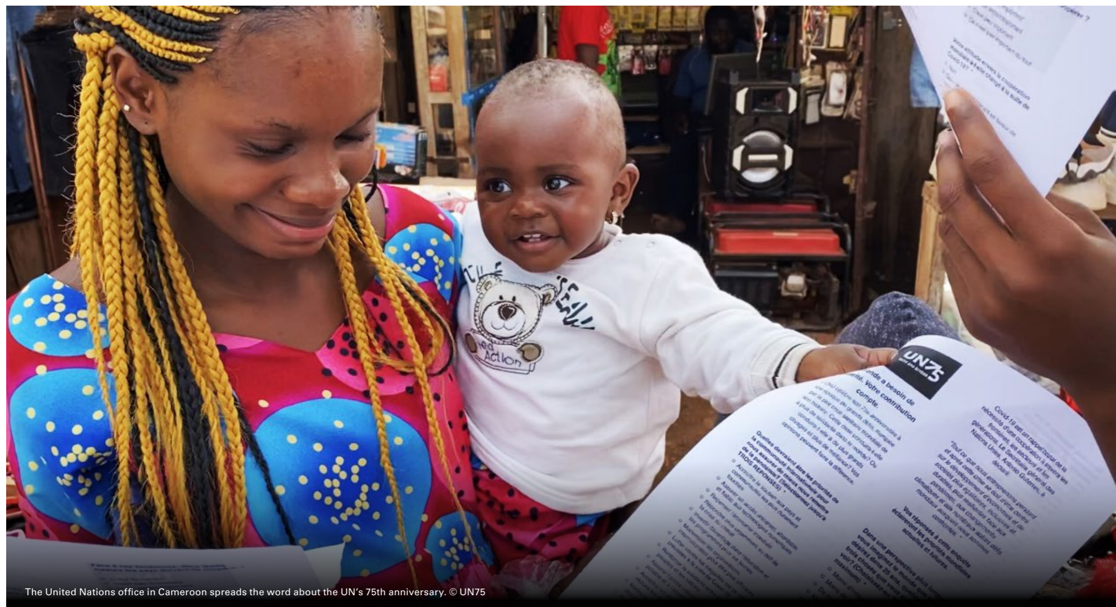
The United Nations office in Cameroon spreads the word about the UN’s 75th anniversary.

The importance of actors beyond the state has been acknowledged in a number of ways over the years, most powerfully in Sustainable Development Goal 17: partnerships for the goals. This importance will only grow as we enter the “decade of action” to deliver the Goals, and as global interconnectedness and horizontal linkages continue to erode the power of the state.