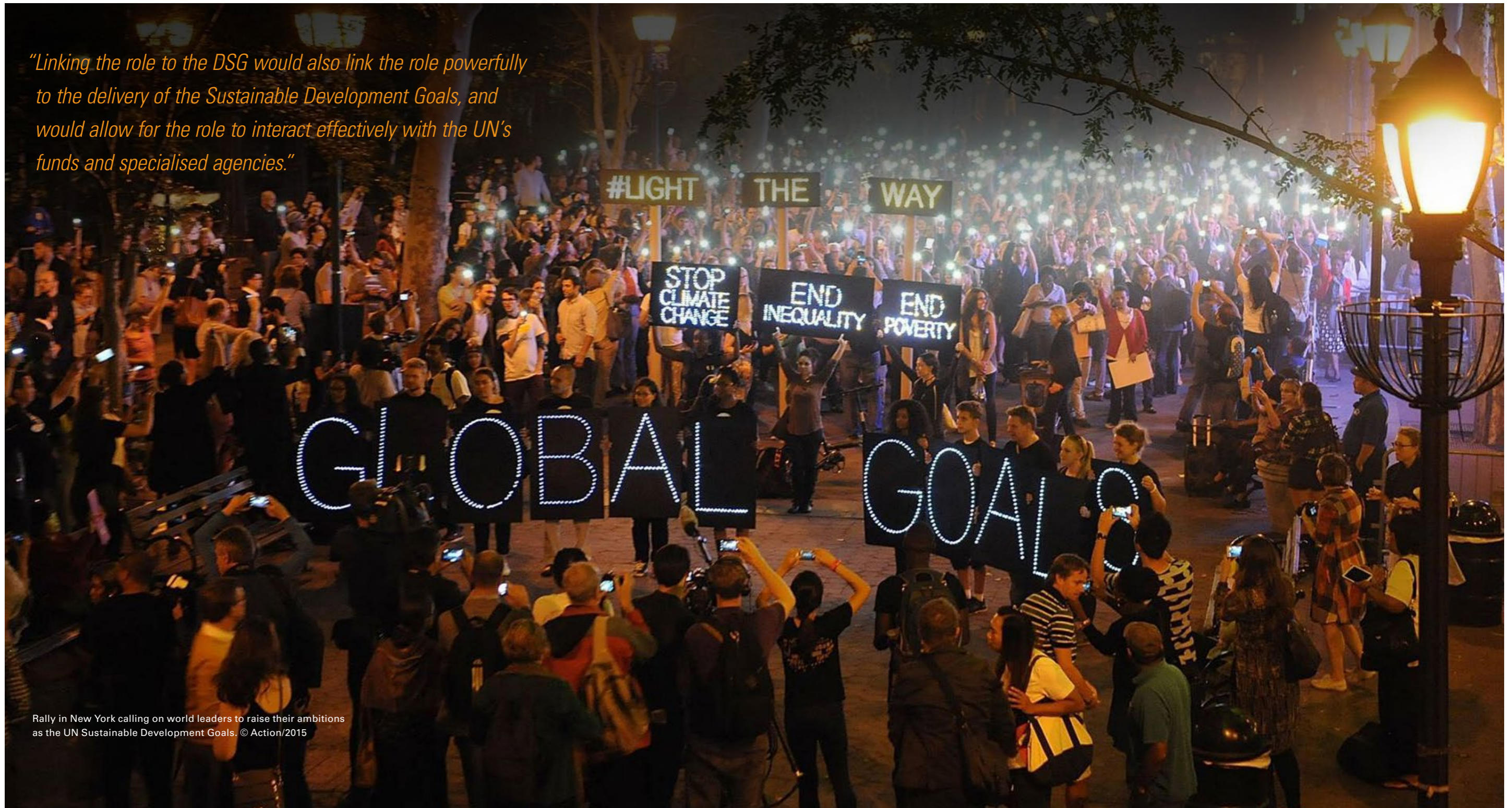
Rally in New York calling on world leaders to raise their ambitions as the UN Sustainable Development Goals.

“Linking the role to the DSG would also link the role powerfully to the delivery of the Sustainable Development Goals, and would allow for the role to interact effectively with the UN’s funds and specialised agencies.”