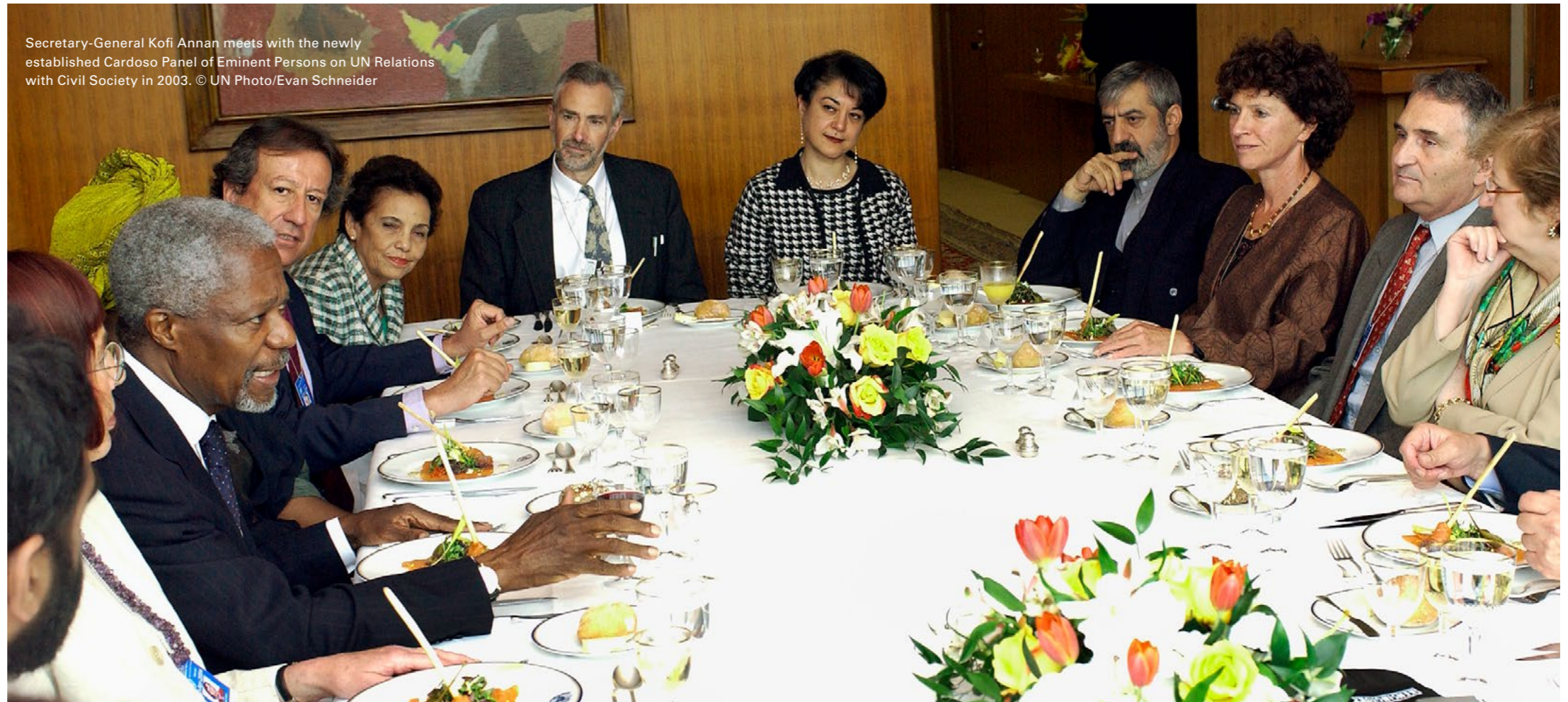
Secretary-General Kofi Annan meets with the newly established Cardoso Panel of Eminent Persons on UN Relations with Civil Society in 2003.

and put in place “information feedback loops” that enable civil society to provide feedback on the implementation and evaluation of programmatic activities and projects.”